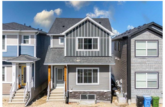
44 Lewiston Dr NE, Calgary, AB

Designed for modern living, this stunning residence seamlessly blends elegance, functionality, and comfort. Upon entering, you™ll be greeted by an abundance of natural light and an open-concept layout that effortlessly connects the inviting family room, illuminated living room, and stylish kitchen. Luxury vinyl plank flooring flows throughout the main level, offering both durability and timeless appeal. This home surpasses standard builder specifications with premium upgrades, including sleek cabinetry, elegant interior doors, designer light fixtures, and sophisticated quartz countertops in the kitchen and bathrooms. Every detail has been carefully curated for refined living. Upstairs, discover three generously sized bedrooms, each offering comfort and charm. The primary suite is a true retreat, featuring a spacious layout, a double vanity, and a separate shower. The unfinished basement presents a versatile space with a separate exterior entrance and a bathroom rough-in- ideal for future development as a legal suite. Your vision can easily come to life. Step outside to the backyard with a large deck, perfect for entertaining or relaxing. Located near the parks, pathways, and recreational facilities, with access to schools, child care, and future