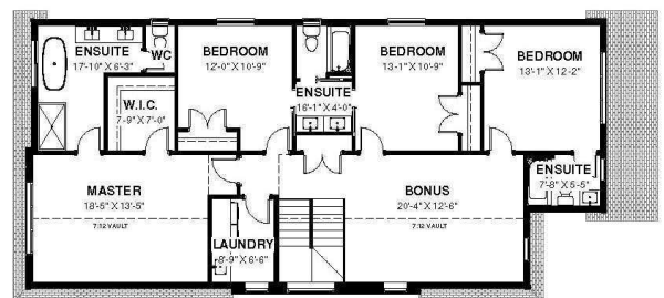
SECOND 1,546 SQ.FT.