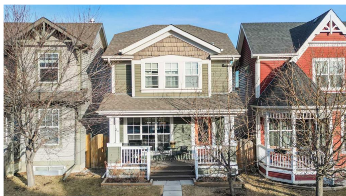
24 AUBURN BAY CRESCENT SE

Jewel of a Deal!!! Convenient Location - Steps away from the Lake, ponds, Ice rink, parks, pathways, schools, shopping, transit, South Pointe Hospital, Seton YMCA, and the new exits. A wonderful URBAN STYLE HOME with many upgraded features & meticulously crafted by the original owner - Truly a family home. Over 1360 SF of living space offering 3 bedrooms, 2.5 baths & a big backyard... Check out the floor plan! This OPEN design features a spectacular CHEF's kitchen looking over the dining area and great room. Upgraded Fit & Finish features include: 3-way gas fireplace, hardwood floors throughout the main floor living areas, light & plumbing fixtures, baseboard, doors and casings... and so much more! The kitchen is masterfully designed for efficiency and entertaining (maple raised panel doors & trims), granite counter tops, upgraded stainless steel appliances (gas stove) & over the range microwave, pantry, computer work station, tiled backsplash, dramatic central island with pendants, raised eating bar for three & under mount stainless steel sink. Upstairs includes an oversized primary bedroom with a full ensuite (Big soaker tub with shower head) and a separate supersized walk-in closet open to the below staircase with railing and two good-sized spare bedrooms. Other impressive features include an Unspoiled basement, a big backyard with a wood deck, a fully fenced backyard, rich front curb appeal with a full-width verandah, and a covered entry. May 22 possession date! Call